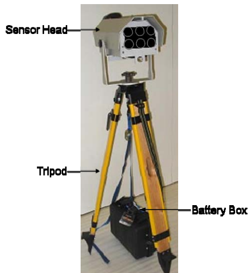
HEL TREM Unit Components